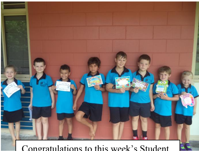
Congratulations to this week's Student of the week winners.