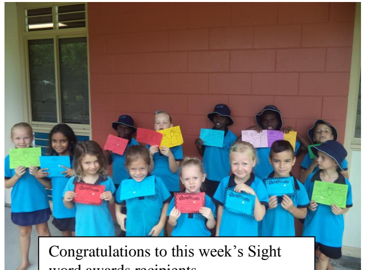
Congratulations to this week's Sight word awards recipients.